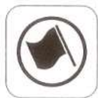
Regularity test start