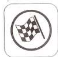
End of regularity test